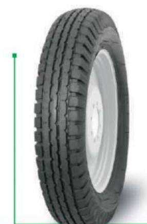
BHIM 5.00-19 6.00-19 7.00-19