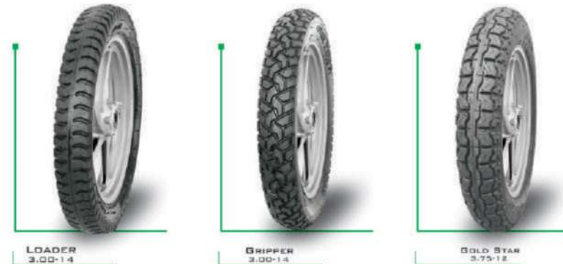
LOADER 3.00-14 GRIPPER 3.00-14 GOLD STAR 3.75-12