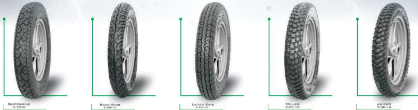
SUPRAMILE 3.50-8 ROAD STAR 3.00-10 LIFTER KING 3.50-10 MILLER 3.00-12 JUMBO 3.00-14