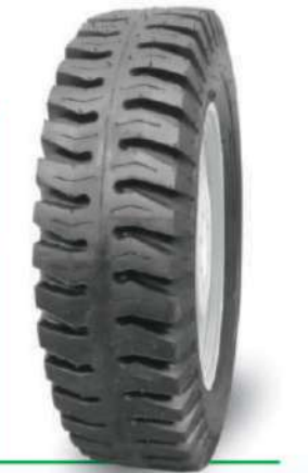
SHAKTI PLUS 9.00-16