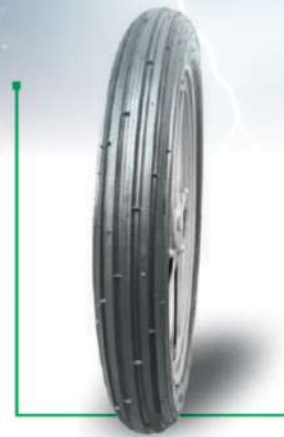
MAXX RIB 2.75-17 2.75-18