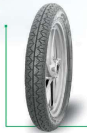
NYLON GRIP 2.75-18