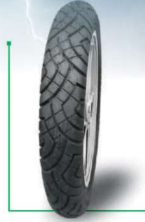
ROAD FIGHTER 100.90-17 100.90-18