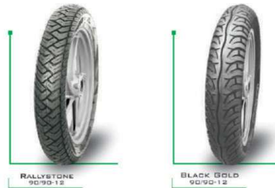
RALLYSTONE 90/90-12 BLACK GOLD 90/90-12