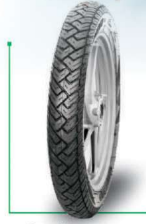
RALLY STONE 2.75-18 3.00-17 3.00-18