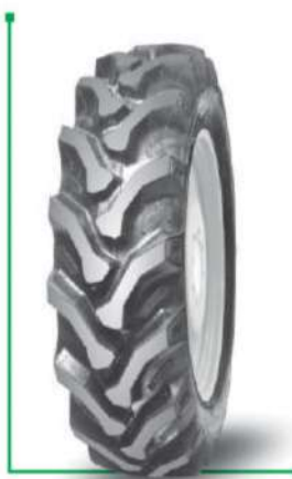
S TRAC +